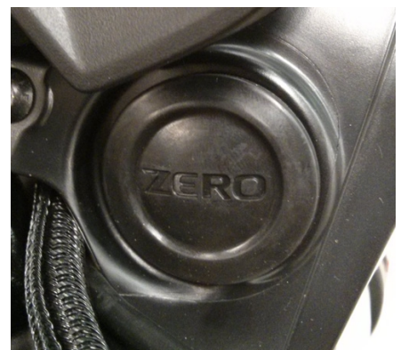
Figure 2. Zero plug