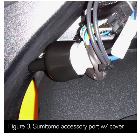
Figure 3. Sumitomo accessory port w/ cover