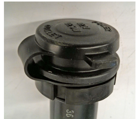
Figure 1. 12V Accessory Socket w/ nut